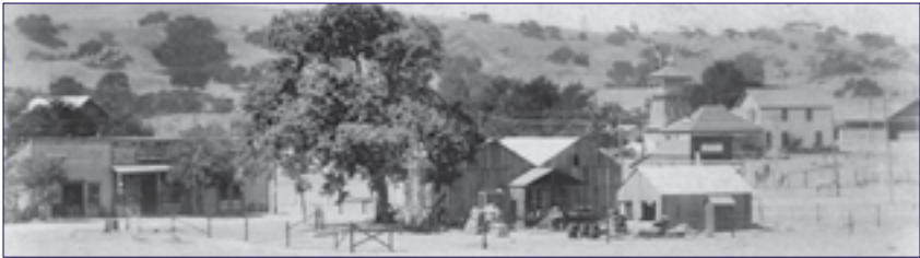
Los Olivos.