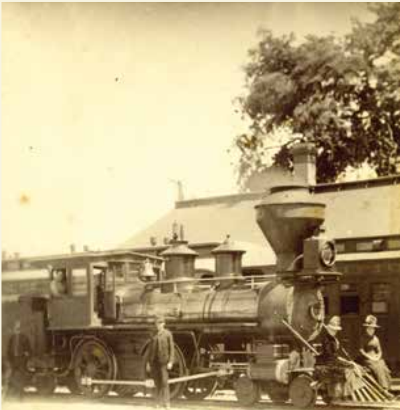
Engine #3 in Los Olivos, 1888